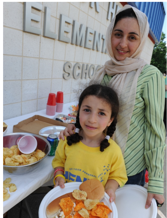
Photo from the AHCA Neighborhood Day BBQ/Picnic