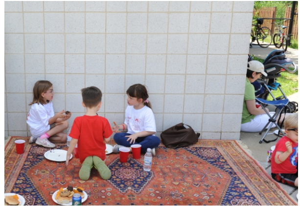
Photo from the AHCA Neighborhood Day BBQ/Picnic

http://www.arlingtonva.us/departments/EnvironmentalServices/dot/planning/page81623.aspx