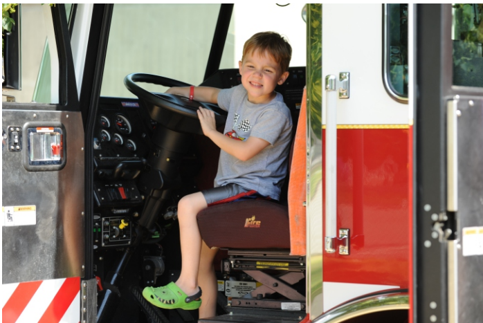
Photo from the AHCA Neighborhood Day BBQ/Picnic

Many residents, and in particular those on South 9th Street, have expressed serious concerns over the details of the proposed plan that directly impact our neighborhood. The AHCA encourages all of our residents to review the proposal and to attend our July 12 Civic Association meeting where we will be asking for feedback regarding this project. Please note we have invited county officials to attend this meeting.